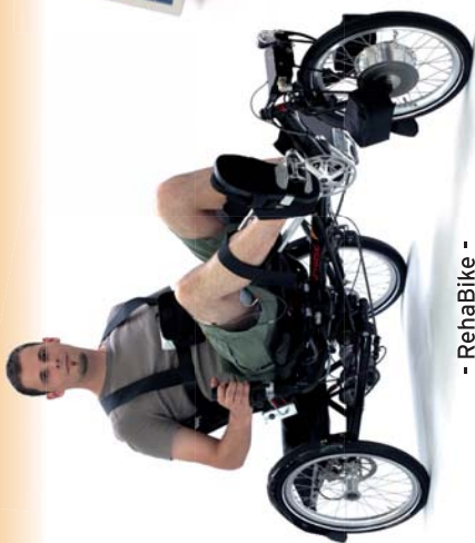
- RehaBike -