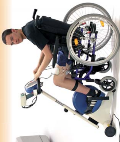
- RehaMove -

HASOMED ® hard- and software for medicine