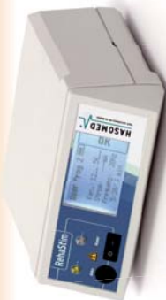
Universal stimulator for FES - RehaStim -